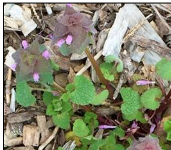
Notice the purplish leaves on the dead nettle plant. Henbit leaves are uniformly green.

Both weeds are winter annuals meaning they grow, flower and then fade away as warm weather sets in. So if these plant is bothering you, give it time, they will go away soon.