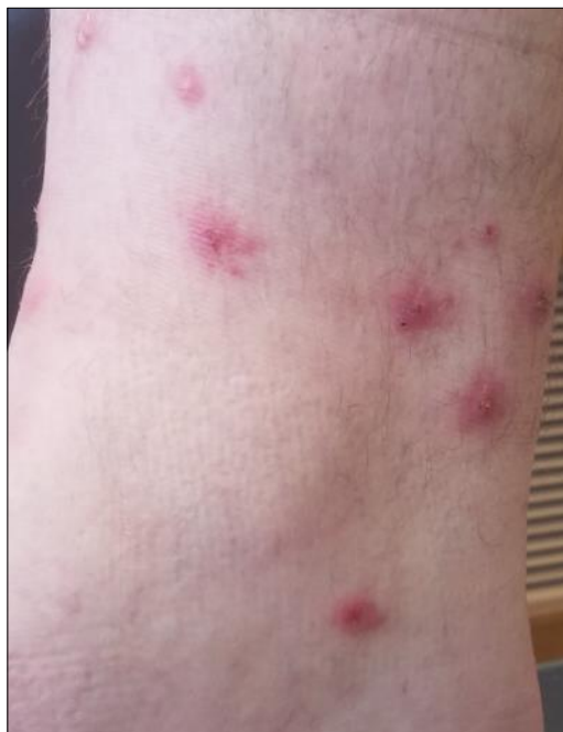
Bites are usually seen on the ankle and lower leg.

https://kentuckypestnews.wordpress.com/2018/06/19/chiggers/